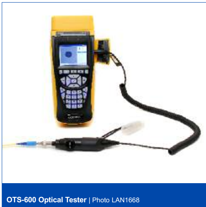
OTS-600 Optical Tester | Photo LAN1668