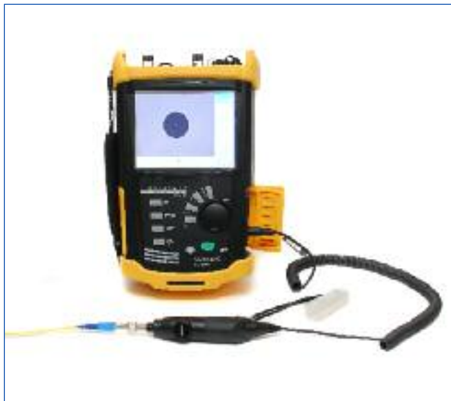
OV-1000 Tester with Probe | Photo LAN1669

Corning Cable Systems Handheld Video Probe is the ideal solution for inspecting the quality of a fiber optic connector end-face. The resulting images can be used to document end-face quality and cleanliness, since the coaxial illumination provides a clear view of end-face condition. The probe's design allows for one-hand operation with a magnification control wheel for users to adjust the image from 200x to 400x, as well as a focus control wheel to bring the image into focus.