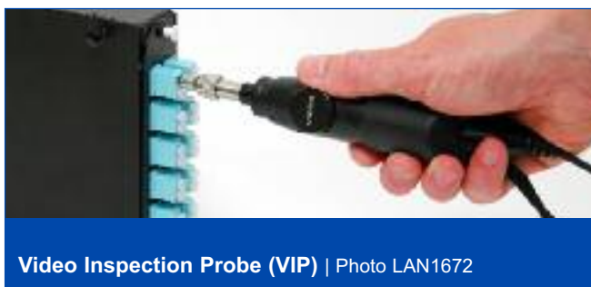
Video Inspection Probe (VIP) | Photo LAN1672