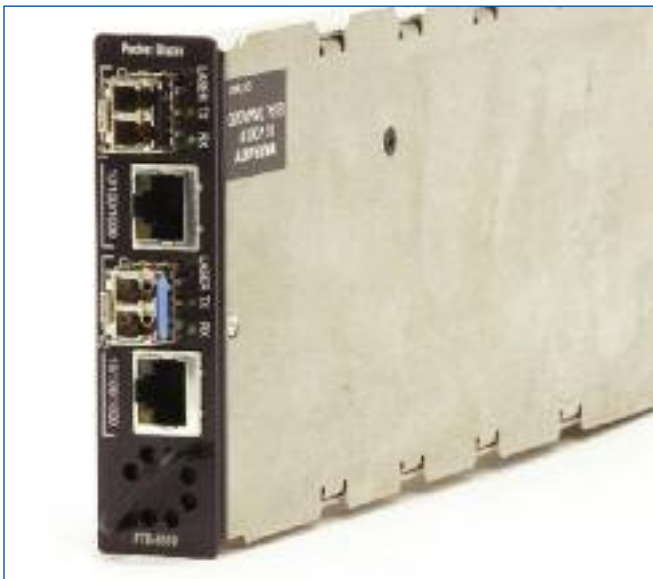
Gigabit Ethernet Module | Photo TEQ33