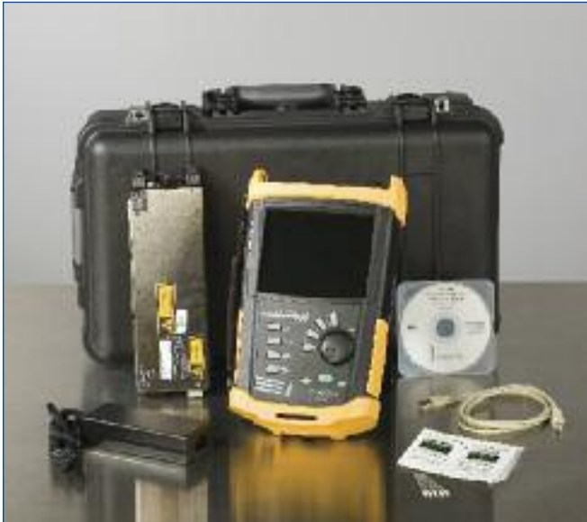
OV-1000 OTDR Kit | Photo LAN730

The OV-1000 has a touch screen keyboard that eliminates the need for an external keyboard and the rugged, splash-proof mainframe allows for testing in harsh conditions. The 6.4-in color touch screen is resistant to shock, water and most common chemicals used in the field. It is large enough to view both the trace and the event table simultaneously, which eliminates the need to toggle back and forth between the two. The unit accommodates up to two field-interchangeable modules, which eliminates the need to change modules as often and offers instantaneous AutoSync USB making it easier and faster to transfer files and perform software upgrades. Along with offering three OTDR test modes — auto, advanced and template trace — the OV-1000 is future-ready with the ability to accept protocol testing modules, such as Gigabit Ethernet.